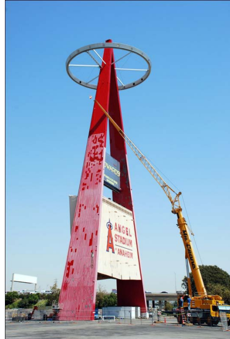
During application August 2009